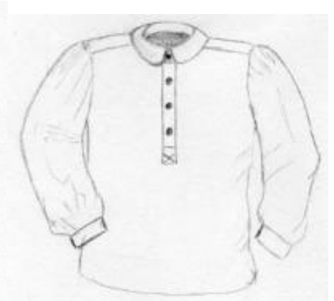
Banker's Collar Shirt

Keep in mind that these shirts were almost always made of cotton. They could be plain, striped, or made from any kind of calico. Corduroy, wool and linen are also acceptable. You want to avoid buttons that are obviously plastic. If you find a shirt that is perfect except for the buttons, it is easy to replace them with period-correct wood, horn, shell, metal or leather buttons.