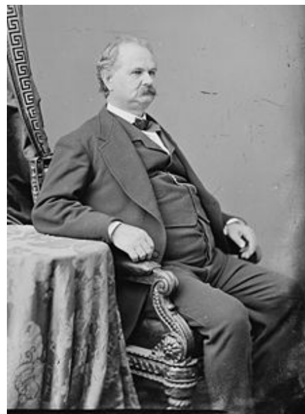
Coles Bashford (1816 – 1878) moved to Prescott, Arizona Territory as a private citizen, and was soon appointed its first Attorney General by Governor Goodwin, serving from 1864 until 1866.

The Boots and Bustles dress covers the period from 1865 to 1893. We try to target our costumes toward the 1870’s and 1880’s, and avoid the Edwardian style of dress that became popular early in the 1890’s. (The Edwardian style for gentlemen is typified by light-colored jackets and pants, and high-buttoned shoes.) It is important to do your own research in order to present a period-correct portrayal for a given point in time within these dates. Your selected persona (i.e. Townsman, miner or military man for example) will have a direct effect on your costume choices. All the details of your outfit, from your hair to your shoes, will tell the world who you are and how much attention you have paid to what you wear. Remember that if your intention is to educate the public, you do them a disservice when you do not present an accurate portrayal. Details such as eyeglasses, spurs, and hats are just as important as your clothes. Spend time looking at vintage pictures from the period to become familiar with the look you are trying to achieve. YOUR CLOTHING CAN (and WILL!) BECOME A MAJOR INVESTMENT, SO TAKE YOUR TIME. Pick a style that suits your age and interest.