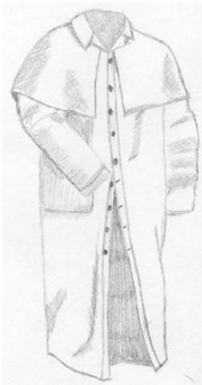
Men’s Range Coat (Duster)