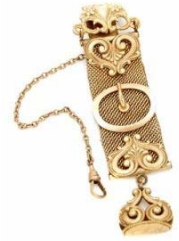
A very fancy vintage watch fob and chain.

When choosing a watch, you should always prefer one that is hand-wound. Avoid a battery-operated watch if you can. That said, unless you are in a costume competition, your battery watch will still give the right look and feel to your costume. The chain can be very plain or decorated with a watch fob. The fob can be almost anything you fancy.