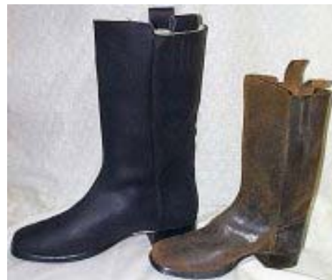
Here is a vintage boot (right) size 5 ½, and the reproduction, size 9 on the left.

The 1881 Cavalry boot was used by cavalry units on both sides in the war between the states. This boot is characterized by a square toe and scalloped knee guard. Used through the 1880’s, this boot was made of horse or mule hide and leather lined for comfort.