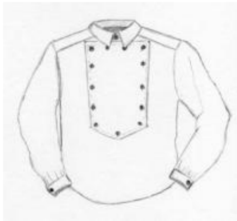
Cavalry Bib Shirt