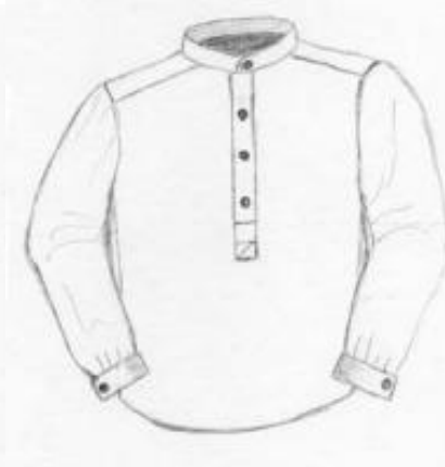
Banded Collar Shirt